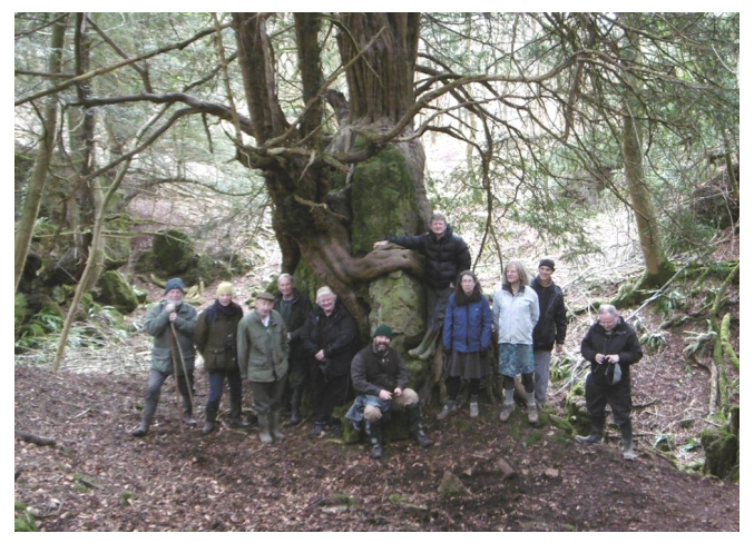
The group visiting the scowles iron ore workings in the Forest of Dean

The blast furnaces in the Forest of Dean did not begin until production in the Weald was peaking and they continued long after the Wealden industry had become a misty memory. Their upstanding remains and their impressive ore-mines were well worth a visit. The group of members who went also visited an