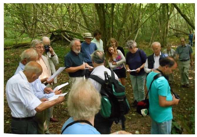
Getting to grips with Frith Furnace

The afternoon foray to Frith furnace followed the tradition of fine weather and, even after a minor hitch in the route taken, an unusual site layout was found in that two streams fed the pond rather than their original meeting point much further east down the valley. The furnace site is owned by the Leconfield Estate but footpaths may be used by the public through Frith Wood beside the A283 just north of North Chapel, but unfortunately there is no public car park here.