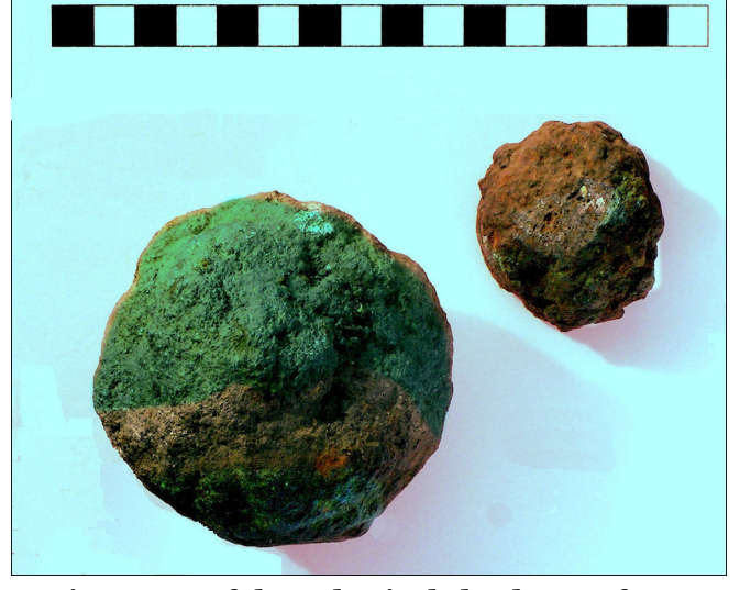
Fig. 1 Two of the spherical slag lumps from Dene Wood, Tonbridge (scale 16cm)

Fig.1 is the puzzling item in question and there are many more of these 'balls' to be found along a footpath in Dene Wood (Shipbourne Forest & Dene Park Wood in the past) north of Tonbridge. The area is now owned by the council and there is public access. This ball weighs 890g, whereas a cast iron ball would weigh 1900g, therefore it is not 100% iron. Most of these very roughly spherical 'balls' (there are a few other irregular shapes) are to be found along an E-W footpath at TQ 6032 5130, along with a