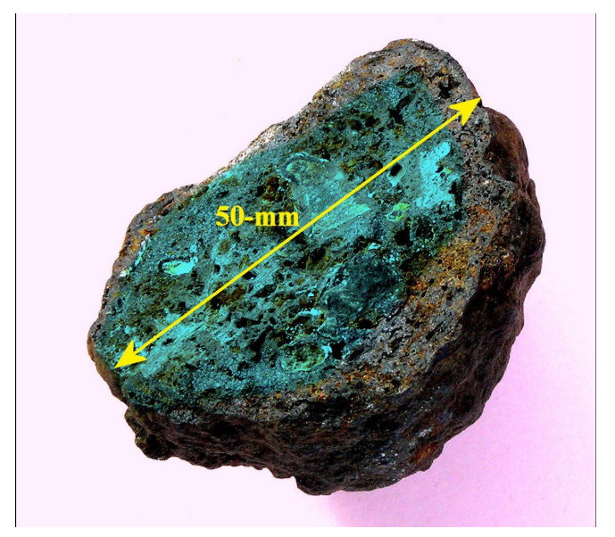
Fig. 2 Sectioned spherical slag lump from Dene Wood, Tonbridge

substantial layer of detritus found with a metal detector, and are also found down the track to the car park in diminishing quantities (OS Explorer map 148). It suggests that the track was specifically surfaced with this material for a route to take something from somewhere close to the footpath.