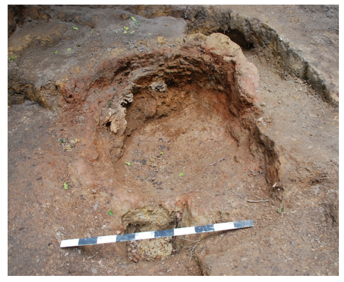
Brokes Wood Iron Age bloomery

The newly formed Southborough & High Brooms Amateur Archaeology Society has been exploring Brokes Wood and has excavated the remains of a bloomery furnace on raised ground between two streams. As can be seen from the photo above, the furnace is poorly preserved but what singles out this site as of importance is the size of the bloomery, which is large for its period, and its dating, from C14, which places it in the Middle to Late Iron Age. The slag shows evidence of wood-marking but although one or two sherds of pottery, consistent with the period, have been found on the site none has been found immediately associated with the bloomery.